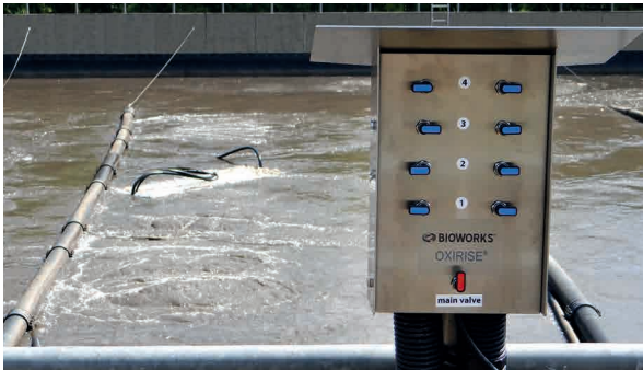
OXIRISE® in practical application

Floating aeration systems are in general easier to maintain than fixed systems. Since the diffusers don't require anchorage at the tank floor, maintenance can be done during operation without emptying the tank. However manual pulling up the diffuser is sometimes cumbersome, due to the slippery hoses and the weight of the diffuser elements. In responding to this field-request BIOWORKS® developed the maintenance- and cleaning system OXIRISE®.